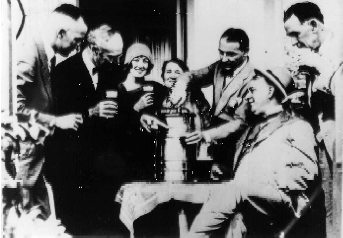
The Staunch God-fearing No-Nonsense Judge enjoying some booze celebrating the end of prohibition!!

He persuaded the organization to purchase a property called Beth Sarim (house of the princes) for the great men of faith when they came back. This property was quite a luxury house worth US$1,000,000. For some unknown reason unknown these great men of faith didn't return, and Armageddon didn't happen.